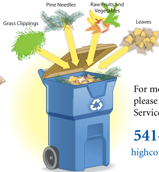
Yard Debris Roll Cart Tan highlighted week (residential only)

For more information please call our Customer Service Department at